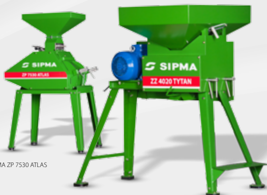
SIPMA ZP 7530 ATLAS

SIPMA ZZ 4020 TYTAN SIPMA ZZ 7520 TYTAN SIPMA ZZ 7530 TYTAN