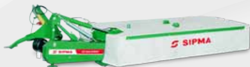
SIPMA KD 2620 SPRINT

SIPMA KD 2620 SPRINT and SIPMA KD 3020 SPRINT are rear-hitched disc mowers with side-suspension. They are modern, lightweight and simple design machines.