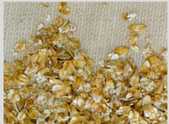
GRAIN AFTER THE USE OF SIPMA GRAIN CRUSHER