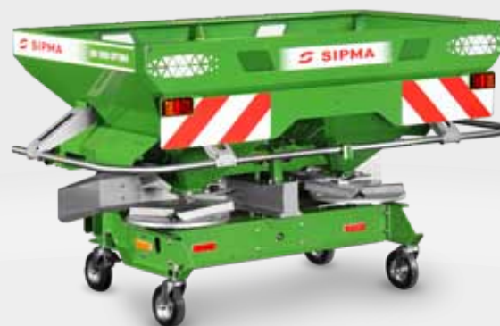
SIPMA RN 1000 OPTIMA

SIPMA RN 1000 OPTIMA and SIPMA RN 1000 OPTIMA PRO mineral fertilizer distributors are equipped with top solutions for precise fertilizer spreading. They ensure high working efficiency and meet the expectations of the most demanding customers.