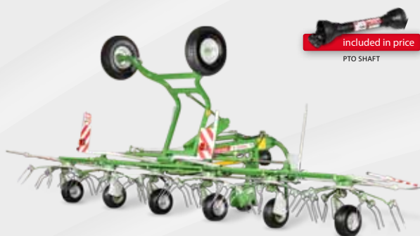
SIPMA PT 675 SALSAL

Trailed tedders SIPMA PT 525 SALSAL and SIPMA PT 675 SALSAL are characterized by high efficiency. Machines guarantee optimal and equal spread of mowed material. Dedicated to work at small and medium farm with tractors with low power and low lifting capacity. Lowering the chassis to transport position is done by hydraulic cylinder.