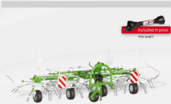
SIPMA PT 520 SALSA