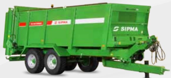
SIPMA RO 1200 TORNADO

SIPMA RO 1200 TORNADO and SIPMA RO 1400 TORNADO manure spreaders are used for spreading manure, compost, peat, chicken manure and lime. Characterized by a solid design and large loading capacity.