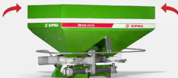
SIPMA RN 610 ANTEK WITH EXTENSION

are easily mounted on the main hopper and allow the hopper capacity to be adjusted as required, making the spreader suitable for use on both small and large areas. Simple assembly to the basket, bolted construction which saves transport space and reduces shipping costs.