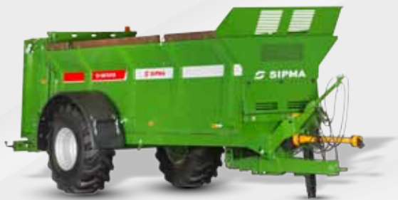
SIPMA RO 1000 TAJFUN