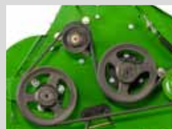
V-BELTS (ATLAS SERIES)