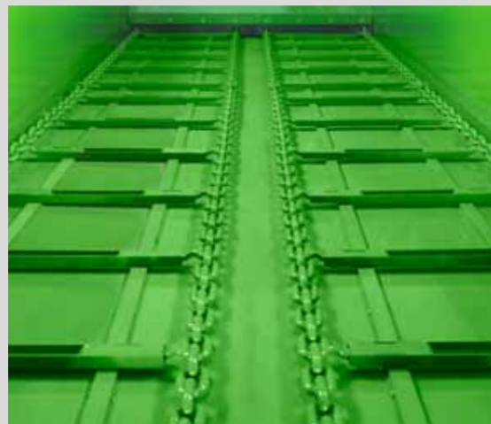
DOUBLE FLOOR CONVEYOR

allows to look into the load box safely.