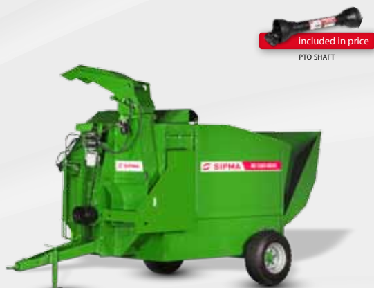
SIPMA RB 1500 KRUK