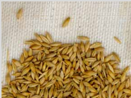
GRAIN BEFORE CRUSHING