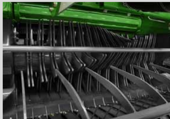
FEEDING AND SHREDDING UNIT

with tilting floor system, equipped with 15 knives, each with individual mechanical protection ensures that the material flows fast and efficiently to the baling chamber. The preset cutting length of 75 mm makes the material perfect for forming properly compacted green fodder bales. Cutting of the collected material makes the bales heavier than bales rolled without cutting, which improves the material handling.