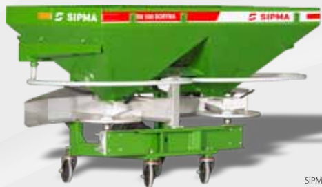
SIPMA RN 500 BORYNA

SIPMA RN 610 ANTEK and SIPMA RN 500 BORYNA mineral fertilizer distributors are easy to operate and economical machines designed for smaller and medium-sized farms.