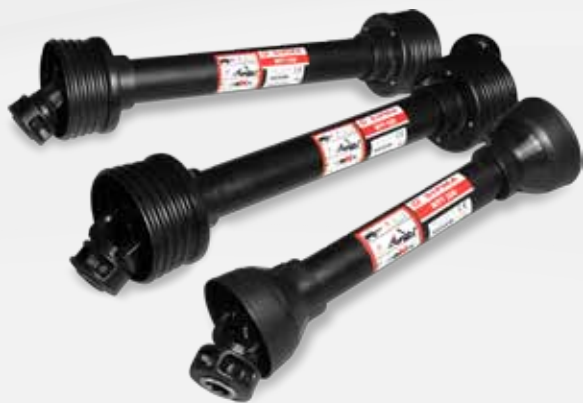
BASIC PTO SHAFTS

SIPMA WPTS 300 SIPMA WPTS 680 SIPMA WPTS 900 SIPMA WPTS 1200