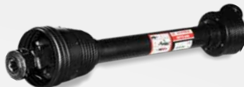
WIDE ANGLE PTO SHAFT

Wide angle PTO shafts are used in the case where the fracture of relative position of the tractor power take off to the machine power input connection shaft can allow reaching up to 50° angles in every working moment and 80° angles temporary. These shafts make it possible continuous power transmission without necessity disengaging the drive on headlands.