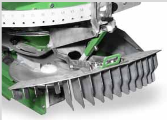
LIMES BORDER SPREADING SYSTEM

allows work to be carried out at field boundaries in accordance with fertiliser regulations, while ensuring that the correct application rate is delivered right up to the field boundary, and eliminates economic losses resulting from over-fertilisation or the spreading of fertiliser to neighbouring fields. Used when the first tramline lies in the middle of the spreader's working width. Made of stainless steel.