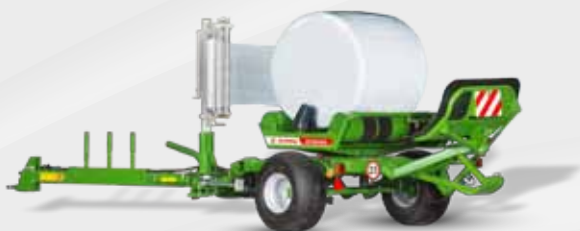
SIPMA OS 7650 GAJA

SIPMA OS 7530 MAJA SIPMA OS 7531 MAJA SIPMA OS 7650 GAJA SIPMA OR 7532 DIANA SIPMA OG 9750 LENA