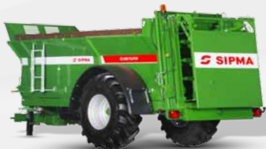
SIPMA RO 800 TAJFUN

SIPMA RO 600 TAJFUN, SIPMA RO 800 TAJFUN and SIPMA RO 1000 TAJFUN are used for spreading manure, compost, peat, chicken manure and lime. They can also be used for transport of agricultural commodities after removing the adapter. They are compatible with tractors equipped with a bottom "hitch" type latch and are fully adapted for transport on public roads.